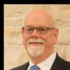
Eddie Price Place 3