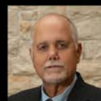
Perry Bynum Place 4