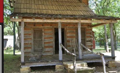
Fall in love with one of Eules's historic landmarks - the Himes Log House. Visit the log house and other historical landmarks at Heritage Park on Saturday, February 14, from noon to 4 p.m. at 201 Cullum Drive.