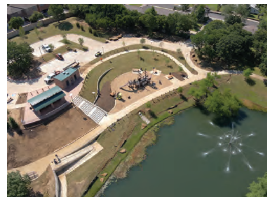
Aerial photographs of Wilshire Park during renovation

Eules Today is published by the City of Eules.